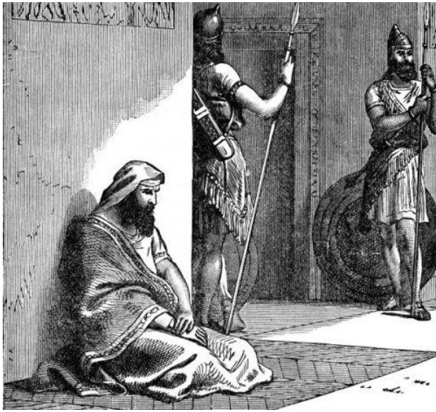
Mordecai sits in sackcloth and ashes at the gate.